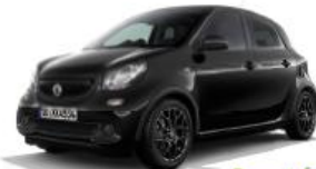
Smart forfour Electric Drive