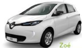
Zoé de Renault