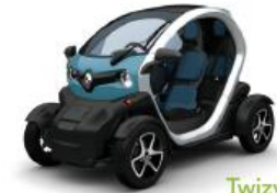
Twizy de Renault