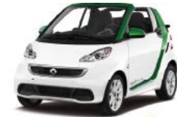
Smart fortwo Cabrio Electric Drive