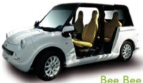
Bee Bee EXCLUSIVITY!