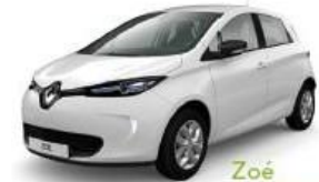
Zoé de Renault