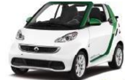
Smart fortwo Cabrio Electric Drive