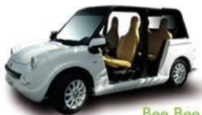
Bee Bee EXCLUSIVITY!