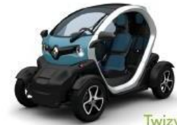
Twizy de Renault

Hôtel Manapany - Anse des Cayes - 97133 Saint-Barthélemy www.hotelmanapany-stbarth.fr www.bsignaturehotels.fr