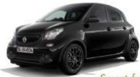
Smart forfour Electric Drive